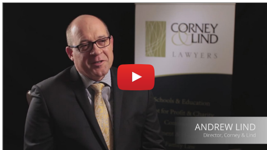
Corney & Lind Lawyers Watch the case study video

Open Practice is supporting the activity of more than 7,400 legal practitioners across 514 Firms right now. Review the following case study videos to hear what legal firms say about working with GlobalX.